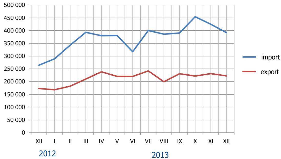
Graph 3. Export and import by month